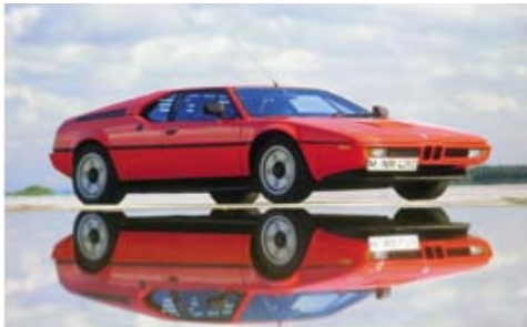
E 26. M1 1978-1981. Probably one of the most desirable BMW's ever built.