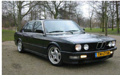
E 28. Euro M5. Arguably the best four door sports sedan built in the eighties.