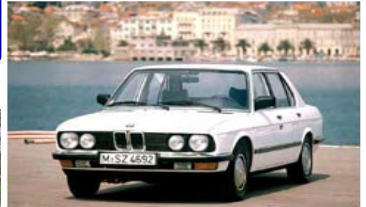
E 28. 1981-1988. One of the most common BMW's in town, why? It's the perfect balance for a four door sports car, exceptionally reliable.